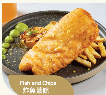
Fish and Chips 炸魚薯條