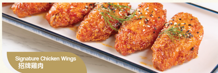
Signature Chicken Wings 招牌雞肉