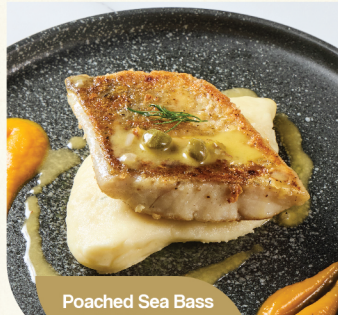
Poached Sea Bass 白灼鱸魚