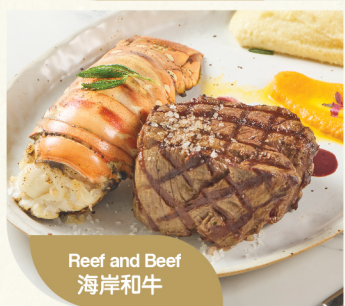
Reef and Beef 海岸和牛