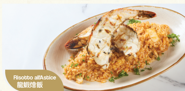
Risotto all'astice 龍蝦燴飯