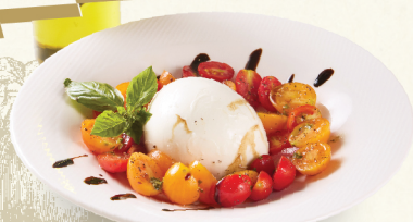
Burrata Salad 布拉塔沙拉