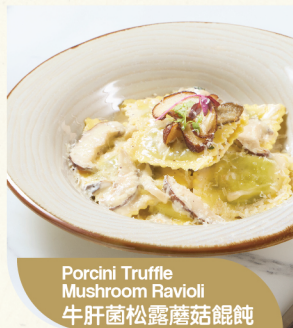
Porcini Truffle Mushroom Ravioli 牛肝菌松露蘑菇餛飩