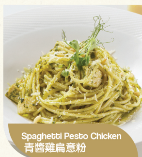
Spaghetti Pesto Chicken 青醬雞扁意粉