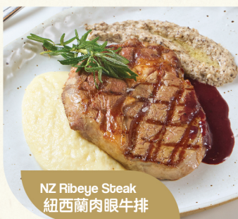
NZ Ribeye Steak 紐西蘭肉眼牛排