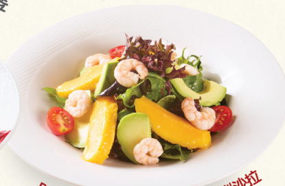
Prawn Mango Avocado 蝦芒果鰐梨沙拉