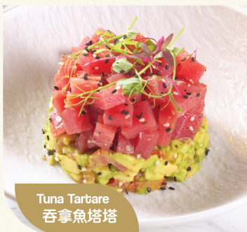
Tuna Tartare 吞拿魚塔塔