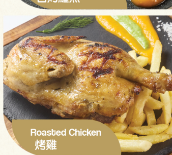
Roasted Chicken 烤雞