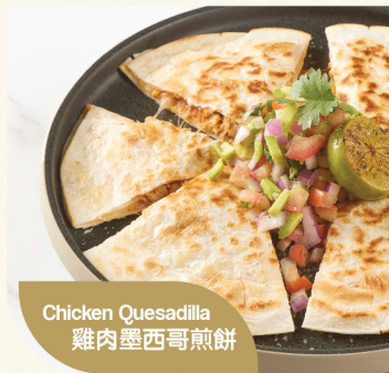
Chicken Quesadilla 雞肉墨西哥煎餅