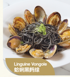
Linguine Vongole 蛤蜊黑麪線