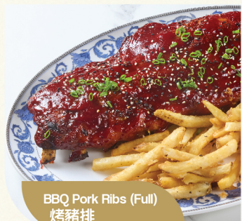
BBQ Pork Ribs (Full) 烤豬排