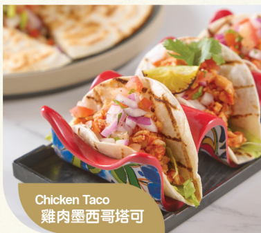
Chicken Taco 雞肉墨西哥塔可