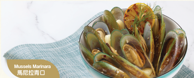
Mussels Marinara 馬尼拉青口